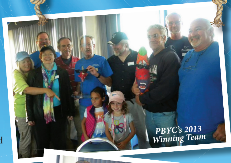
PBYC's 2013 Winning Team